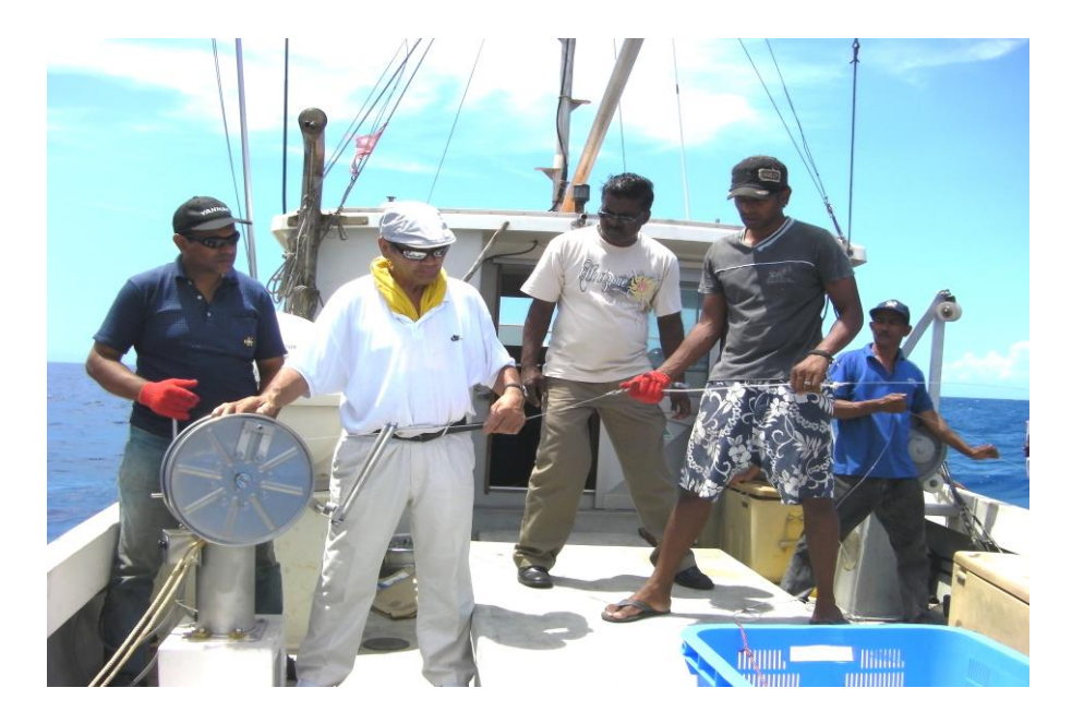
OFCF (Japan) Expert coaching trainers of FiTEC in new fishing technique

FiTEC ensures that it has a well-trained human resource to meet customer expectations by exposing its personnel with the latest technological advances in the field of fisheries. The assistance of renowned fishing agencies are sought in that respect.