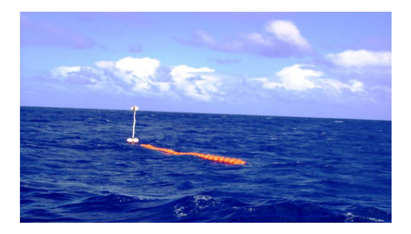
FADs are deployed around the island for the direct benefit of fishermen