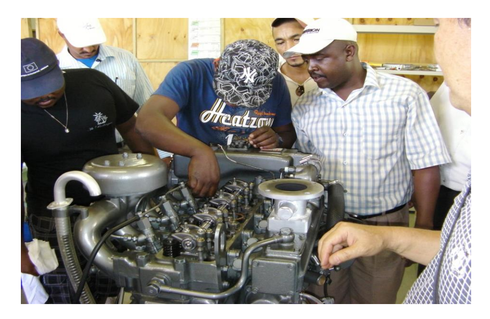
Training in maintenance of engines for enhanced safety at sea

The FAD Fishery Training Course addresses the training needs of registered fishermen willing to leave the lagoon and venture out for off lagoon fishing. It also targets fishermen interested to upgrade their fishing skills around FADs. After completing this training course the fishermen are able to safely and efficiently fish pelagic species in the open sea around FADs, using new fishing techniques. The course is of 3 weeks duration and also comprises practical sessions at sea. A certificate of attendance is awarded to the trainee who completes the training course. Each trainee is also eligible to a stipend of 300 rupees per day of attendance.