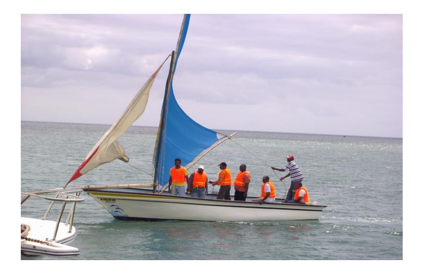
Training on the use of sails to save fuel, reduce pollution and increase safety