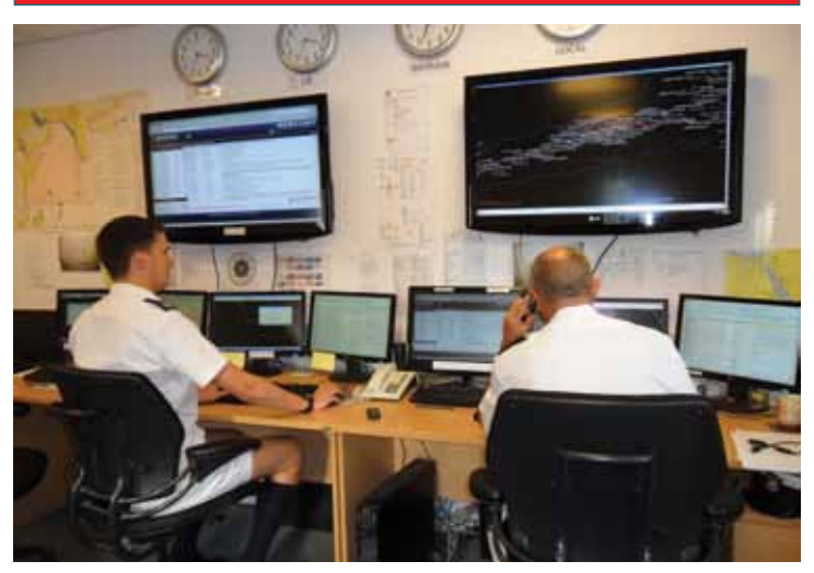
Operations room UKMTO

It is important that vessels and their operators complete both the UKMTO Vessel Position Reporting Forms and register with MSCHOA