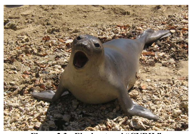
Figure 2.3: Elephant seal "CYRIL"

A male elephant seal (fig. 2.3) weighing about 200kg and measuring 1m60cm was found stranded on the shore at Pointe Koenig in the region of Rivière Noire on 9 August. It was in healthy condition and was named "CYRIL". The National Coast Guard and Fisheries Protection Services carried out sea and land patrols to protect the animal. The Mauritius Marine Conservation Society and Mauritius Wildlife Fund established contacts for the transportation of the seal to a sanctuary abroad. Meanwhile it was brought to Albion Fisheries Research Centre where it was kept in a pond. On 26 August the seal was boarded on a French ship to Kerguelen.