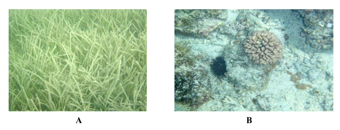
Figure 2.2: Regeneration of the ecosystem (A: Seagrass (Syringodium isoetifolium at Grand Gaube); B: Juvenile hard corals (Pocillopora sp.) at GRSE

The yearly monitoring of ex-sand mining sites was carried out at Grand Gaube, Poudre d'Or, Mahebourg and Grand River South East (GRSE). The results showed that the marine ecosystem has recovered to a large extent in terms of flora and fauna (figure 2.2). The colonisation of the sandy bottom by rhizoids of sea grasses was visible practically everywhere and many macrolagae species were also noted. There was an increase in the number of species of fish and coral recruitment was observed.